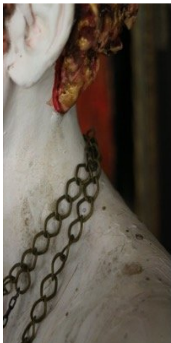
Kirsten Stingle, Minerva (detail)

ROME ART WEEK La settimana dell'arte contemporanea 21-26 ottobre 2019 romeartweek.com | #romeartweek